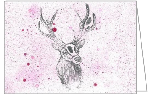
Last Year's Winning Entry

The deadline for entries will be Friday 24 th November in order for us to select and print the designs.