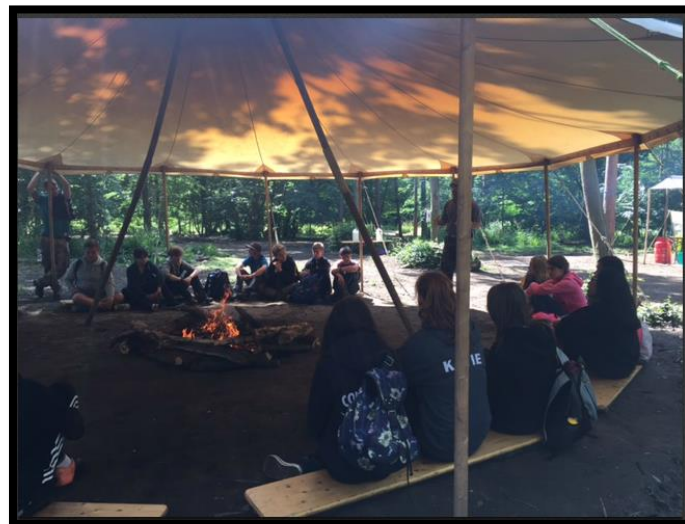
Y9 Bushcraft Survival Trip