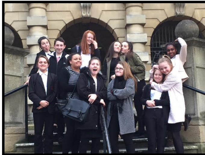
Y9 Mock Trial Group