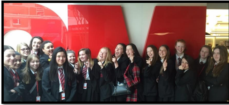
Y9 girls at 3M for International Women's Day