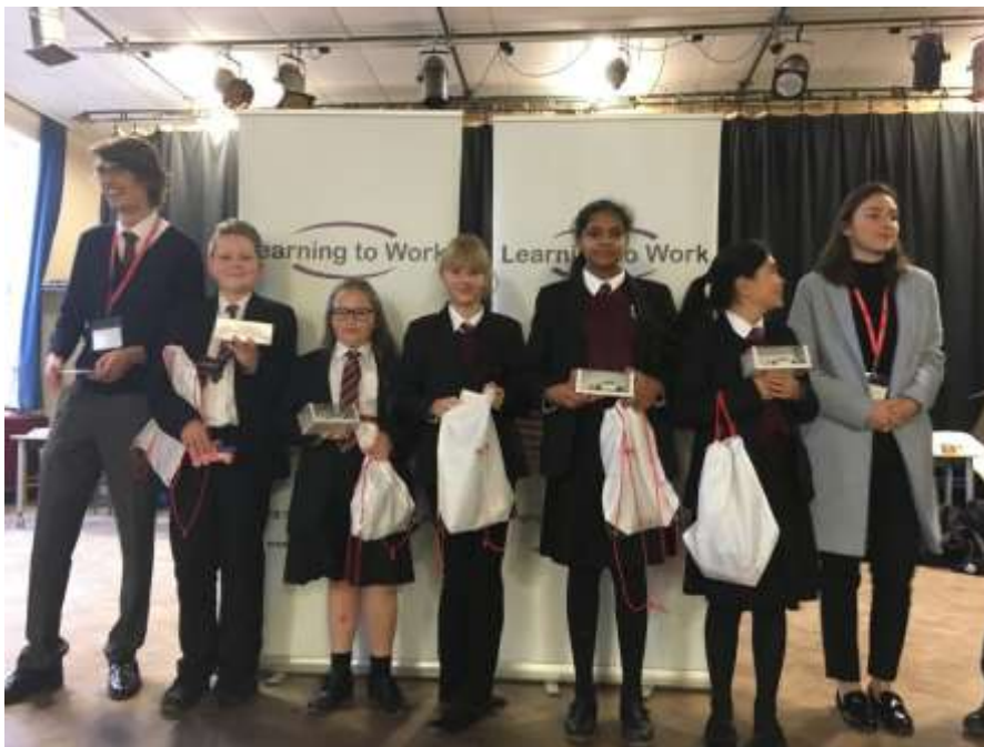
Year 7 Students receiving awards for their outstanding presentation from Honda and Learning to

Students in Year 7 have also worked with Bracknell Forest homes and the Learning to Work group, creating their own mini-van business enterprises. Students had to present their business ideas to employees of Honda and several of these presentations were of an outstanding calibre.