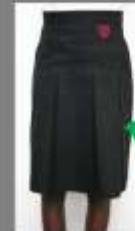
SCHOOL SKIRT (with logo on waistband, knee-length)