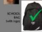
SCHOOL BAG (with logo)